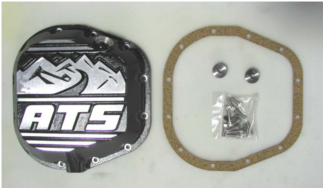
Figure 1: Sterling 10.25 & 10.5 ATS Protector Differential Cover Kit

For some installations, removing the spare tire may provide better access to the work area. It is not necessary in every case. The installer should determine if there is adequate workspace prior to starting the installation.